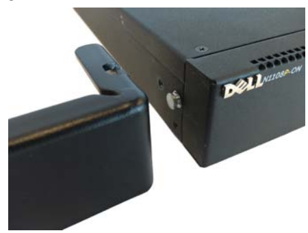
Figure 1-3. Attaching the Brackets

Place the supplied rack-mounting bracket on one side of the switch, ensuring that the mounting holes on the switch line up to the mounting holes in the rack-mounting bracket. Figure 1-3 illustrates where to mount the brackets